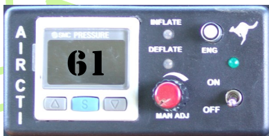
DIGITAL CONTROLS READOUT