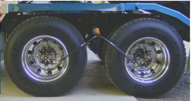
B PLAT T8 FG - Platinum Kit - Tandem Drive Truck - Flat Guards - 8 Tyres