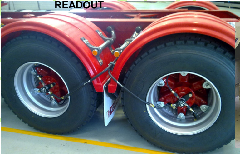
B PLAT T8 PG - Platinum Kit - Tandem Drive Truck - Plastic Guards - 8 Tyres