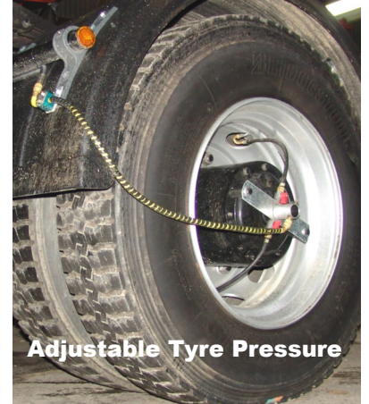
Adjustable Tyre Pressure

AIR CTI makes dialing in the correct tyre pressure easy, lowering costs, minimizing all tyre problems, while improving safety, and vehicle reliability, while minimizing environmental damage and CO 2 . Check out www.aircti.com